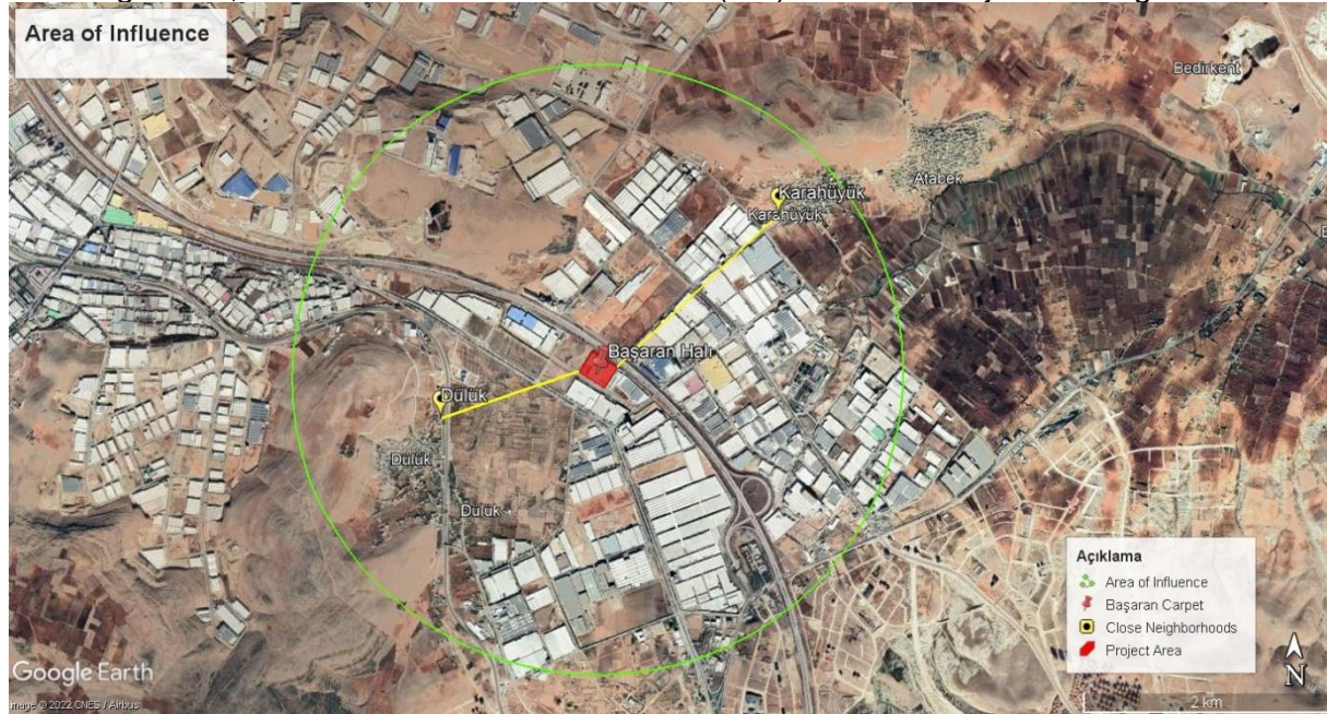
Figure 1-2. Since the Project area is located within the OIZ and the natural gas consumption process causes air pollutant emissions from the stacks in the facility, the Aol is determined as a circle with a radius of 2.5 km.

The populations, closest distances to the Project area and the directions are given in the following table, and the Area of Influence (Aol) of the Project are given in the